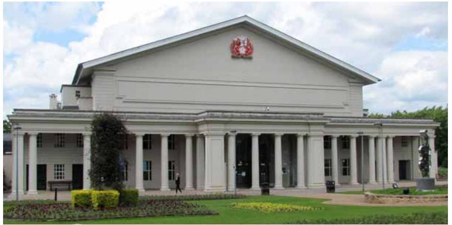
De Montfort Hall

The Hall was built in 1913 and is named after Simon de Montfort. He was the Sixth Earl of Leicester. The Hall is not the only way De Montfort is remembered in Leicester and we will hear more about him later in the walk.