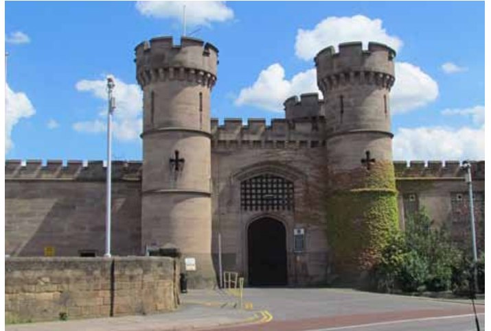
HM Prison Leicester is often mistaken for a castle

The journalist William Cobbett, who wrote about his journeys around England in the 19th century, criticised the people of Leicester for being proud of the prison. He felt it would be more praiseworthy to have an absence of crime!