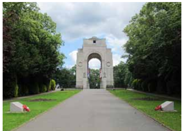
Views of multicultural Leicester