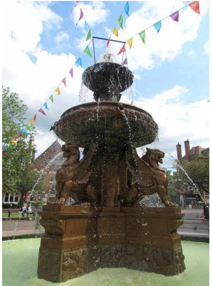
The Town Hall Square fountain

Each migrant community has brought their languages, beliefs, customs and foods and we have seen evidence of this in various places of worship, shops and markets around the city. This diversity has made Leicester one of Britain's most vibrant and multicultural cities.