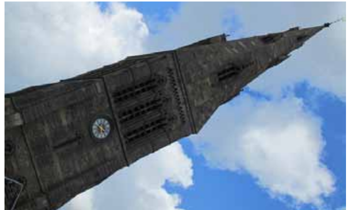
Leicester Cathedral spire

The cathedral has many other links with France. For example, the east window was installed as a monument to those who died in the First World War in France and Belgium. The window shows various saints including Joan of Arc.