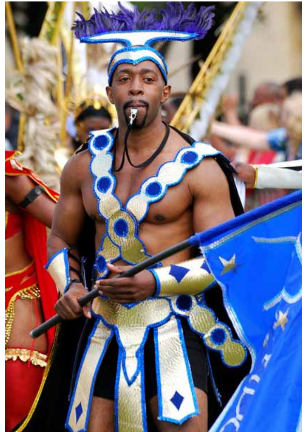
Dancers at the Caribbean Carnival

The Centre also tries to bring Jamaican culture to the city. For example salt fish pancakes are sold here on the Christian tradition of Pancake Day. Salt fish is the national dish of Jamaica. The Centre is also important in Leicester's Caribbean Carnival which is the second-largest in Britain.