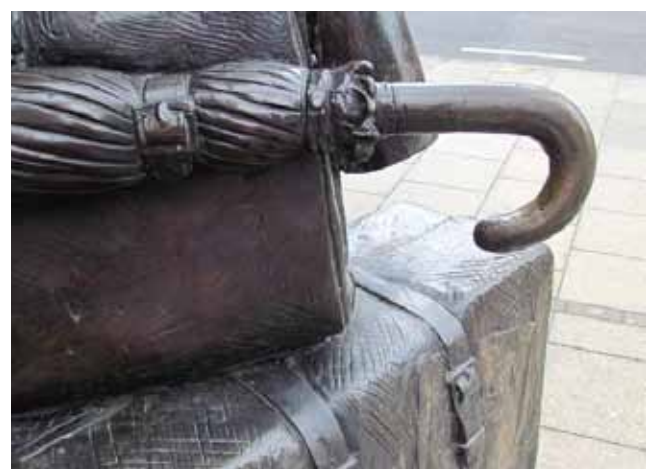
Views of multicultural Leicester