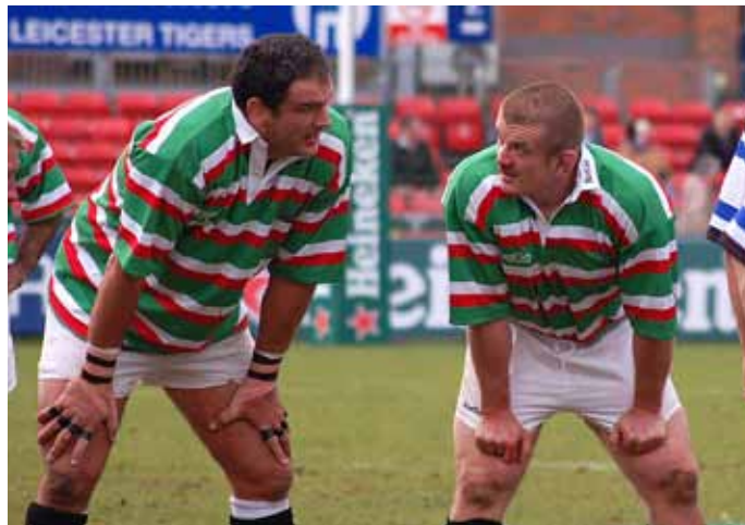
Tigers players Martin Johnson and Graham Rowntree, 2007

Leicester Tigers are England's most successful rugby club, winning a record nine championships. The Tigers were founded in 1880 as Leicester Football Club after three local teams merged.