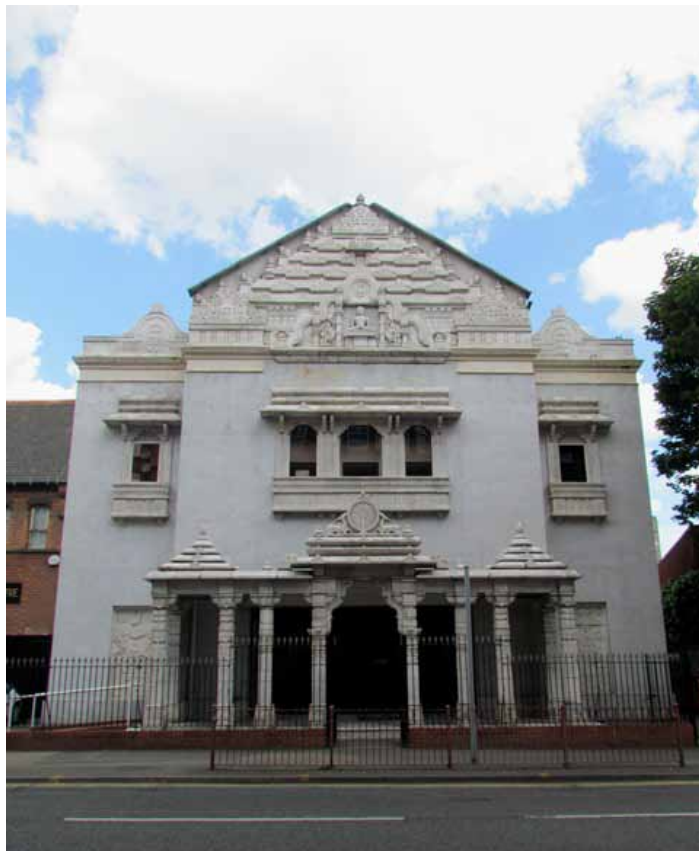
The Jain Centre, complete with its incredible carved marble

Jains believe that time rotates in a cosmic circle and Jain texts describe the universe and its constituents as eternal. The Jain temple in Leicester is the first in the world to bring together in one building all the main sects of Jains. Inside are forty-four beautifully carved pillars showing scenes from Jain legends.