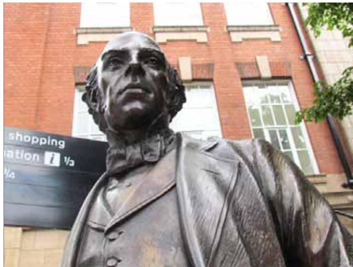
Thomas Cook's statue

When he arrived Cook learned that the people he was meeting with had to go on to Loughborough. So he suggested a special train should be arranged for them. The Midland Railway Company approved and 500 passengers travelled to Loughborough and back for a shilling on a train arranged by Thomas Cook.