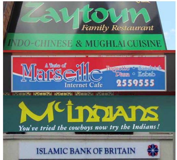
Some of Leicester's international shop fronts

Migration to Leicester from these countries began after the 1948 British Nationality Act which gave people who lived in countries of the British Commonwealth the right to move to Britain. As we heard earlier many people were encouraged to migrate to Britain due to a shortage of workers after the Second World War.