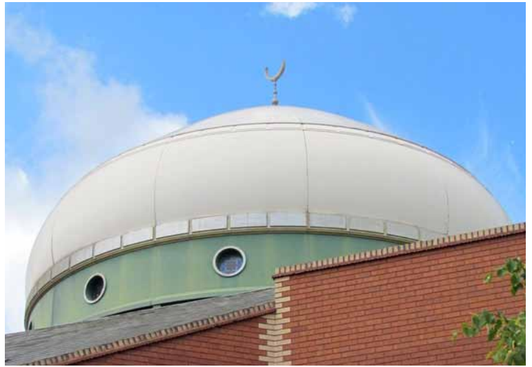
The mosque's domed roof

This building is Leicester Central Mosque which was built in 1988. Mosques are places of worship for people who believe in Islam. Islam is mainly practised in Arabian states such as Iran, Afghanistan and Syria as well as Pakistan. Islam has over 1 billion followers worldwide.