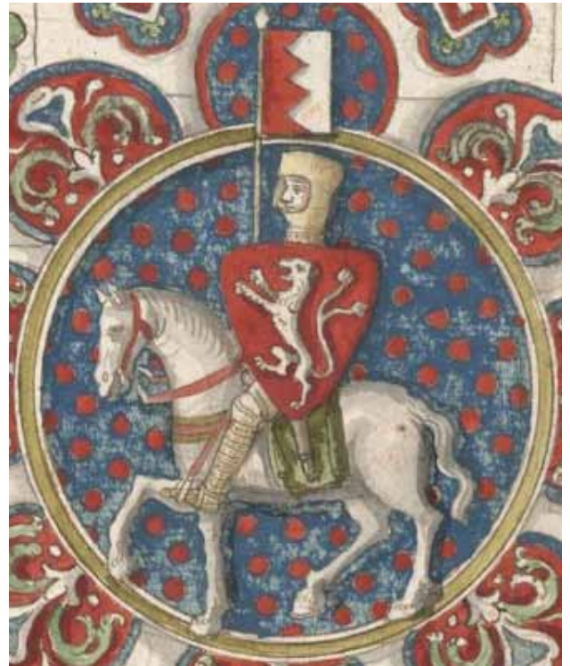
Simon de Montfort depicted in a stained glass window at Chartres Cathedral in France

After a rule of just over a year he was killed by forces loyal to the king in the Battle of Evesham. Various local honours in Leicester were dedicated to his memory. There is also a statue of him on the Haymarket Memorial Clock Tower. A relief of de Montfort also features on the wall of the Chamber of the United States House of Representatives.