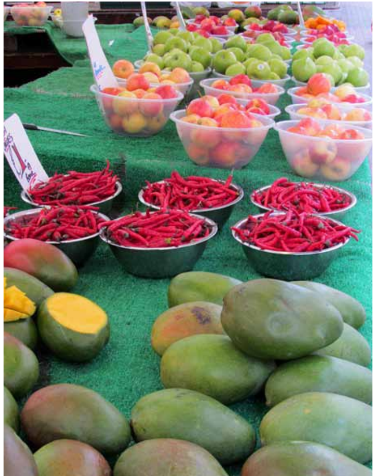
Some of the produce for sale at Leicester Market

We found pomegranates from India, Pakistan and Africa, strawberries from France and North America, bananas from South East Asia, kiwis from New Zealand, star fruit from Sri Lanka and Bangladesh and watermelon from South Africa. See what you can spot! The traders are more than happy to provide advice on making exotic dishes with such ingredients.