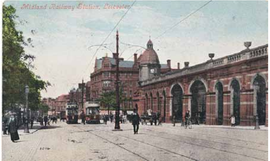
Leicester station in the 1900s when it was known as Midland Railway Station

The way Leicester's station has been rebuilt over time reflects how many people from around the world have changed the city.