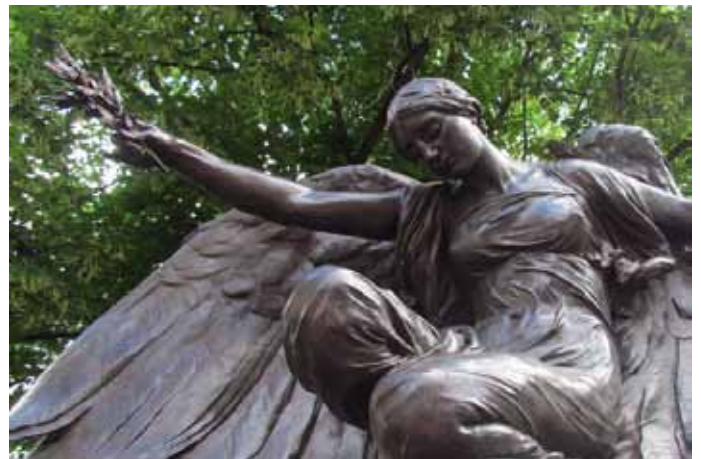
The 'War' and 'Peace' sculptures of the Boer War memorial