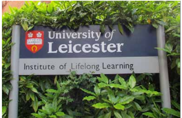
The sign and crest at one of the University buildings

There are around 23,000 students here from over 70 countries. Each year over 450 visiting students come to Leicester as part of Study Abroad exchange agreements with 50 overseas universities in 11 countries. Students also come here from Erasmus exchange partners in another 22 European countries.