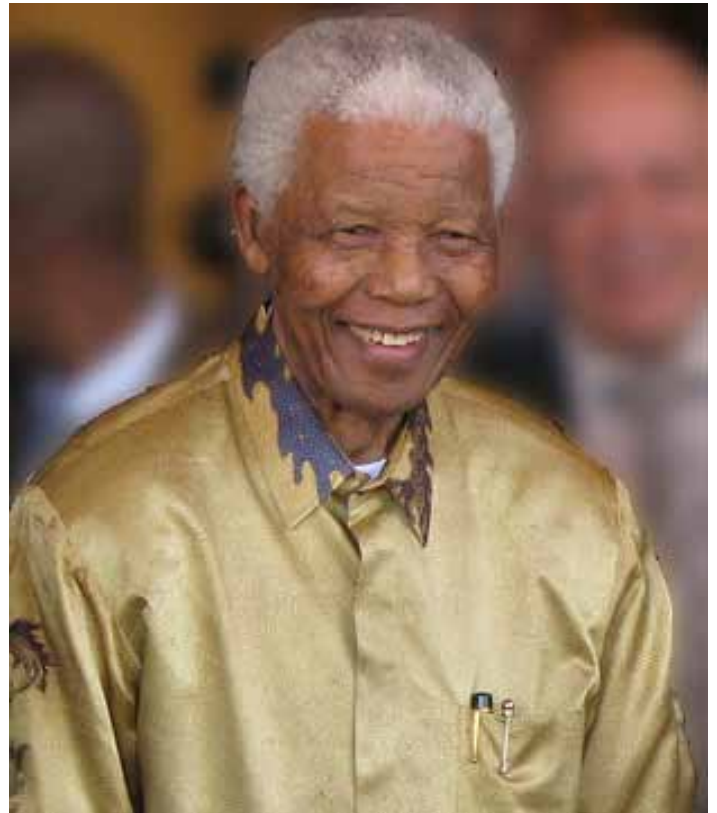
Nelson Mandela in 2008

People from around the world campaigned for his release from prison which eventually came in February 1990. Four years later Mandela became the first democratically-elected President of South Africa. Nelson Mandela Park features signs that quote Mandela's speeches including one that says "There is no easy walk to freedom anywhere".